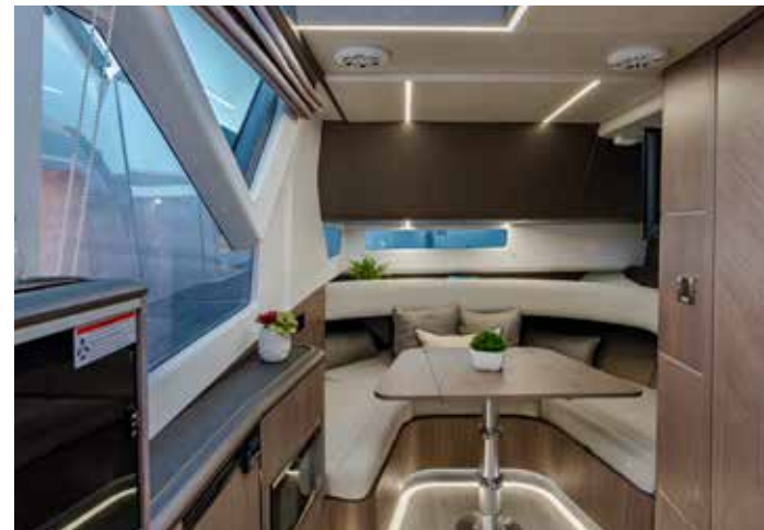
Below deck impresses with yacht quality finishes and sleeps 4, making this an enviable choice for an overnight excursion.

Note: The right is reserved to make changes, without notice, at any time, in equipment, materials, and specifications. Drawings, photos, and renderings may contain optional equipment.