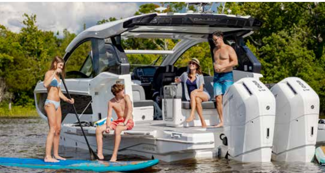
The 375 GTO has Galeon DNA in spades, and it’s particularly on display when her trademark “Beach Mode” is activated.