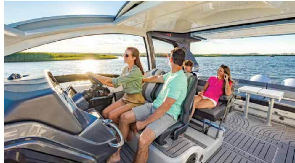
An enclosed, spacious helm offers protection from the elements with an outdoor area protected by an electric awning.

A dayboat like no other, the Galeon 375 GTO is aptly named – Grand Touring Outboard. Offering unparalleled excitement, both the boat’s helm and profile take inspiration from the auto-racing world making this model nothing short of a pleasure to drive.