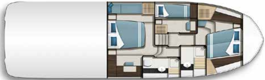
3-CABIN - STANDARD