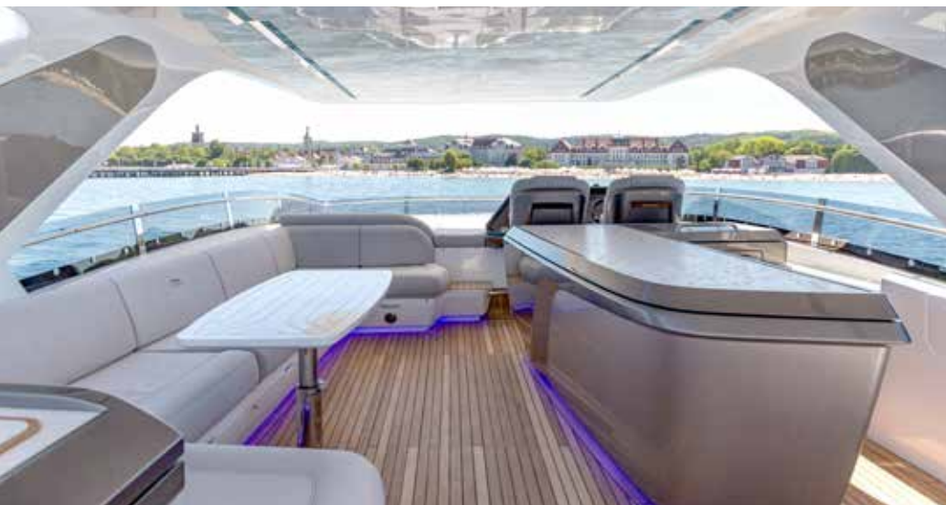
Spacious flybridge deck with a full summer kitchen and wet bar with plentiful plush seating.

T he 800 FLY is the culmination of world-famous and award-winning naval architect Tony Castro's brilliant design and Galeon's extensive, fourth-generation yacht manufacturing experience. The far-reaching knowledge, comprehensive talents, and extensive experience has achieved near perfection, combining a sporty profile while delivering impressive performance, space, and opulence. The flagship 800 FLY offers best-in-class luxury and comfort, paired with the latest technology, safety, performance, and seaworthiness.