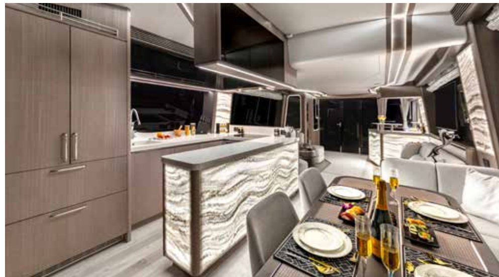
The salon is accessed from the cockpit via massive sliding doors. Forward is the fully furnished galley. Across from the galley is a large formal dining area.