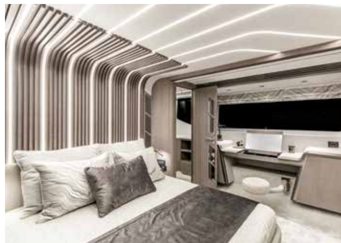
The full-beam owner's cabin is amidship with a walk-in hanging locker and en suite head for complete privacy.